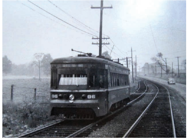
Sixty Five Years Ago: Red Arrow high-speed trolley #86 headed for Upper Darby, on August 18, 1948. The trolley is in the Chester Road passing siding alongside West Chester Pike near Manley Road in Westtown Township. The tract of land in the background is now the Marketplace Shopping Center.