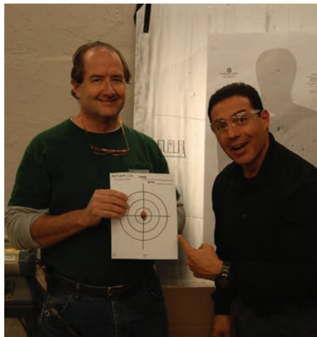
Photo #3: A class participant checks his target after firing a weapon loaded with Simunitions (non-lethal training ammunition).