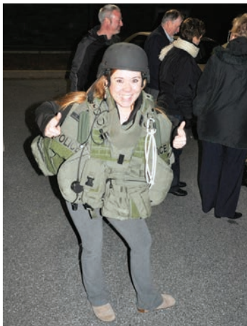
A class participant tries on the equipment worn by members of the Emergency Response Team (E.R.T.).