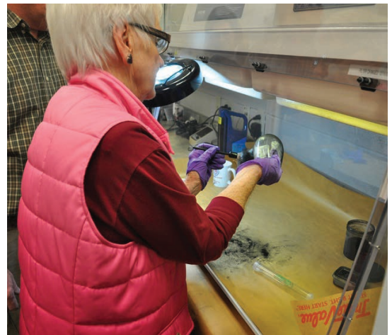
A class participant applies black fingerprint powder in an effort to locate latent fingerprints on a glass jar in the evidence lab.