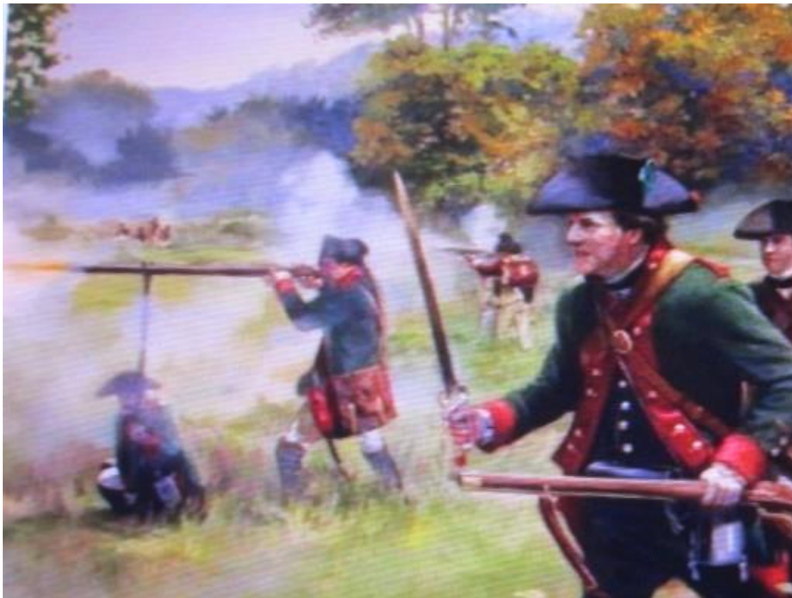
Hessian soldier firing an amusette (light cannon mounted on a swivel that could fire a large ball) at Battle of Brandywine.